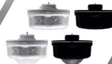
IR & MW MOTION SENSORS