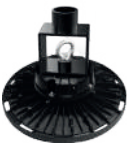
PENDANT MOUNT BRACKET